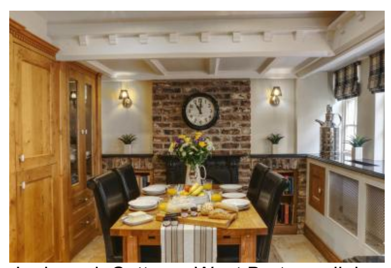
Inglenook Cottage, West Burton - dining area