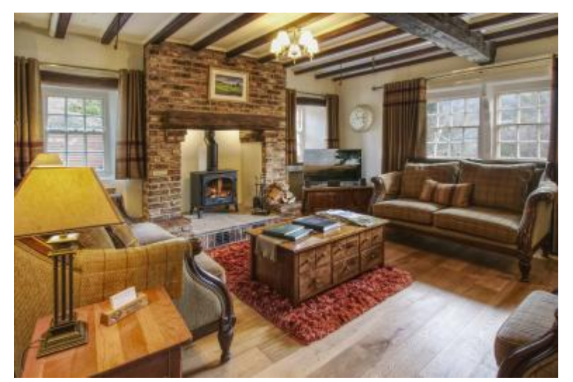
Inglenook Cottage, West Burton – lounge