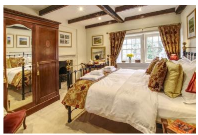
Inglenook Cottage - master bedroom