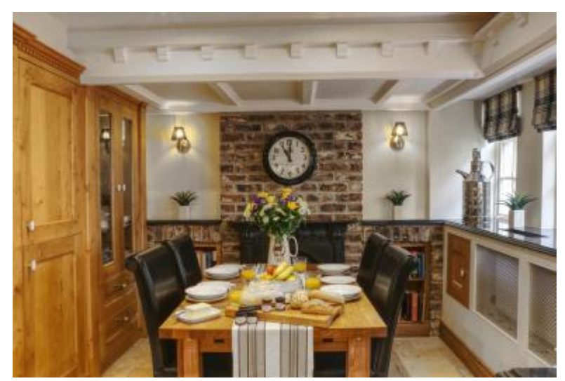
Inglenook Cottage, West Burton - dining area