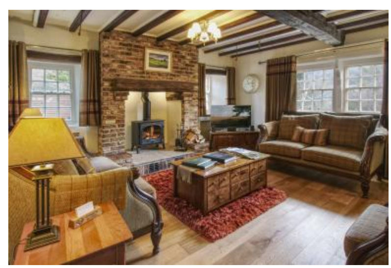
Inglenook Cottage - lounge

• There are 3 steps down from the rear entrance into the kitchen then a level area throughout the ground floor, which is a limestone floor in the kitchen and solid oak in the lounge and front hallway. There is also access from the front of the house up one step into the front hallway and then level access into the lounge.