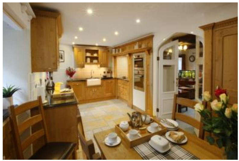
Inglenook Cottage, West Burton - kitchen

• The table and plates have high colour contrast.