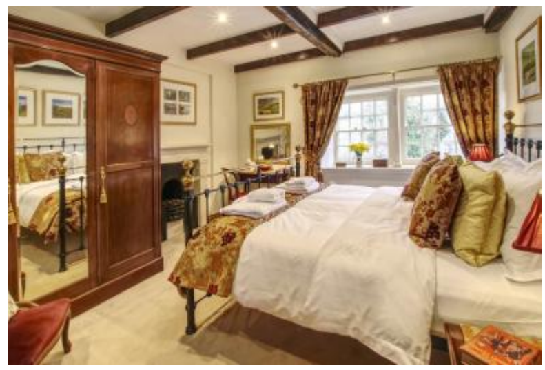
Inglenook Cottage, West Burton - master bedroom