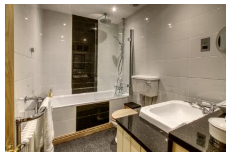
Inglenook Cottage, West Burton - bathroom