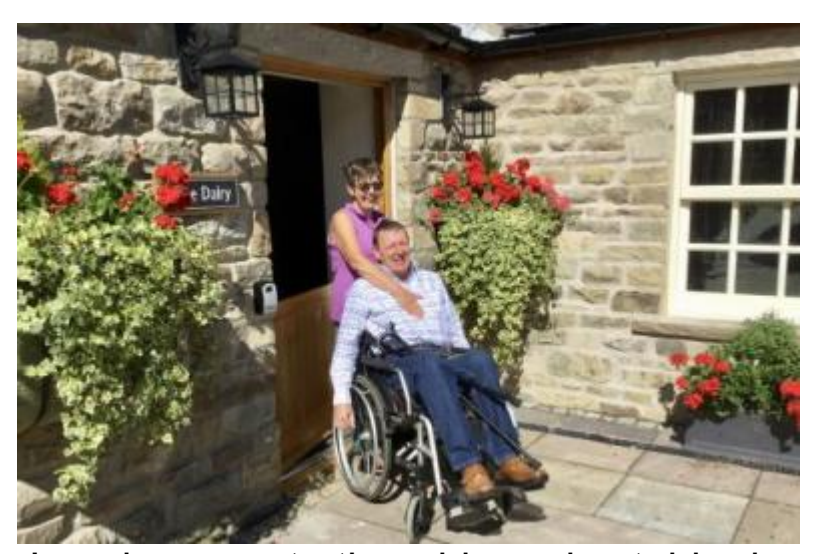
Level access to the wide main stable door of The Dairy