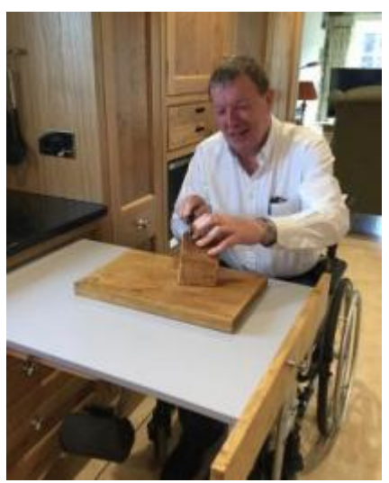
The Dairy, Newbiggin - kitchen pull out accessible work surface