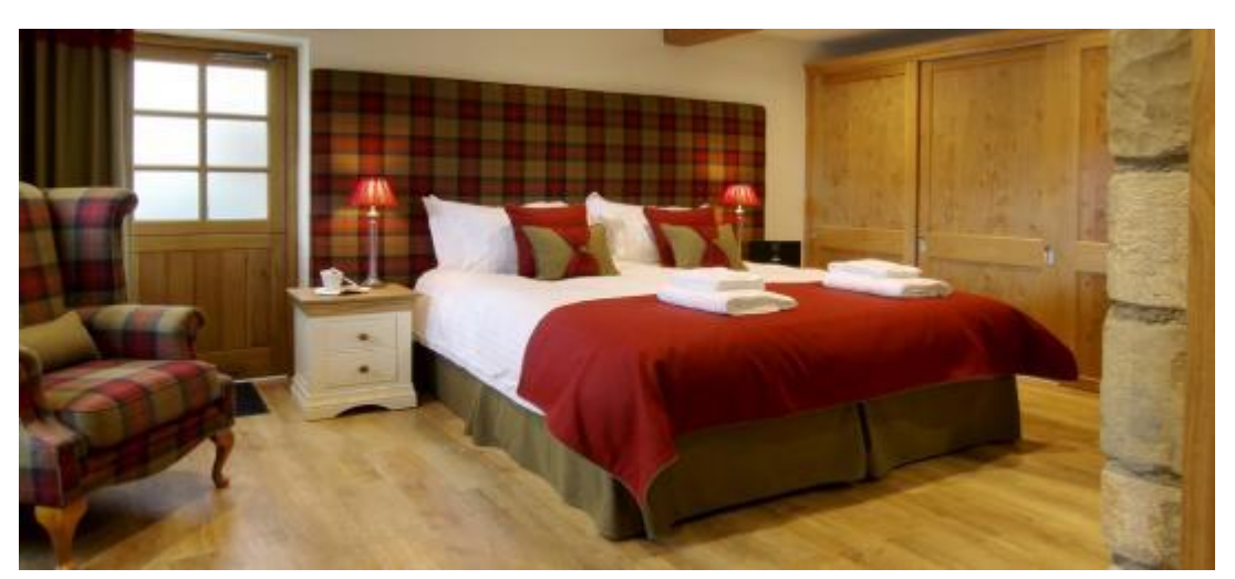
The Dairy bedroom as a super king zip/link master bed

All sockets and switches are polished chrome, which contrast to the cream walls. The floors contrast with the walls as all skirtings are in solid oak. Around each room the Karndean flooring has a black line to help mark out the edges of the floors, thereby aiding spacial awareness, as well as looking good too!