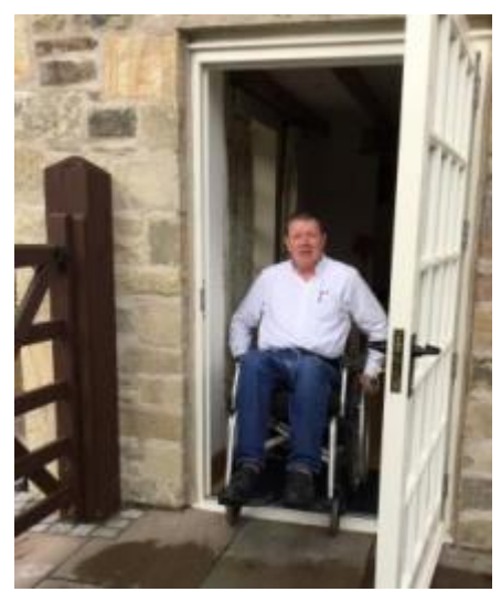
The Dairy - direct level access from the lounge to the private patio