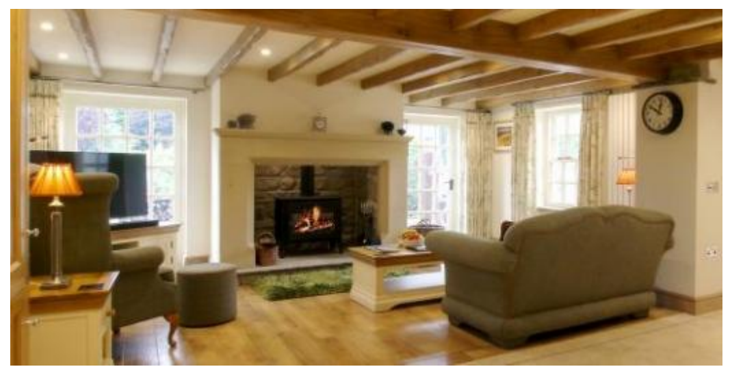
The Dairy, Newbiggin - lounge with log burning stove & access to the private patio