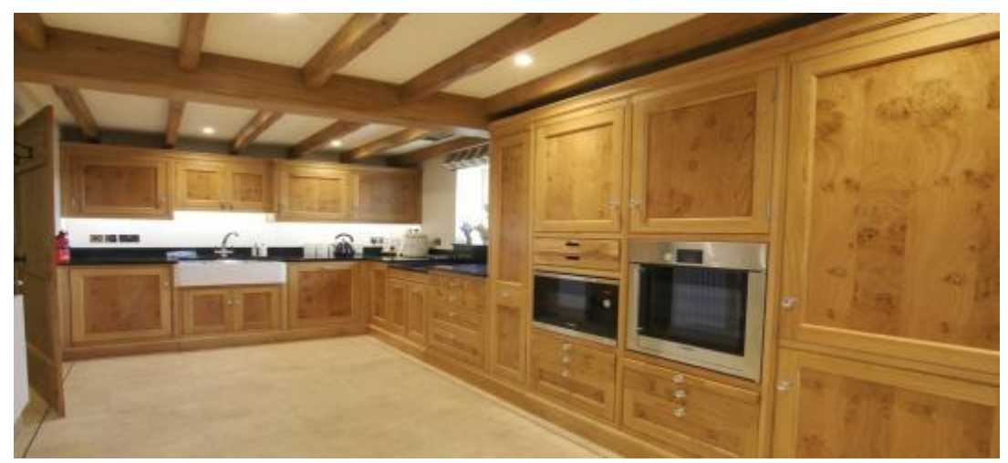
The Dairy, Newbiggin, - kitchen highlighting where NO accessible facilities are needed