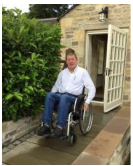
The Dairy - down 1:12 slope to the private patio