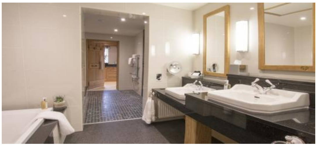
The Dairy bathroom - double sinks at different heights