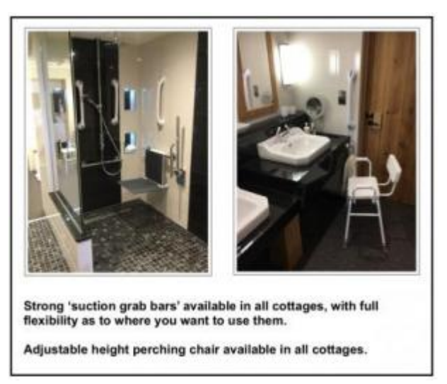
Portable equipment for use in bathroom at The Dairy