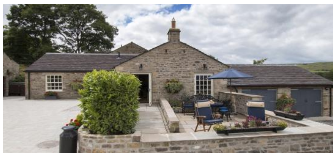
The Dairy - private patio with direct access from the lounge down a slope to the patio