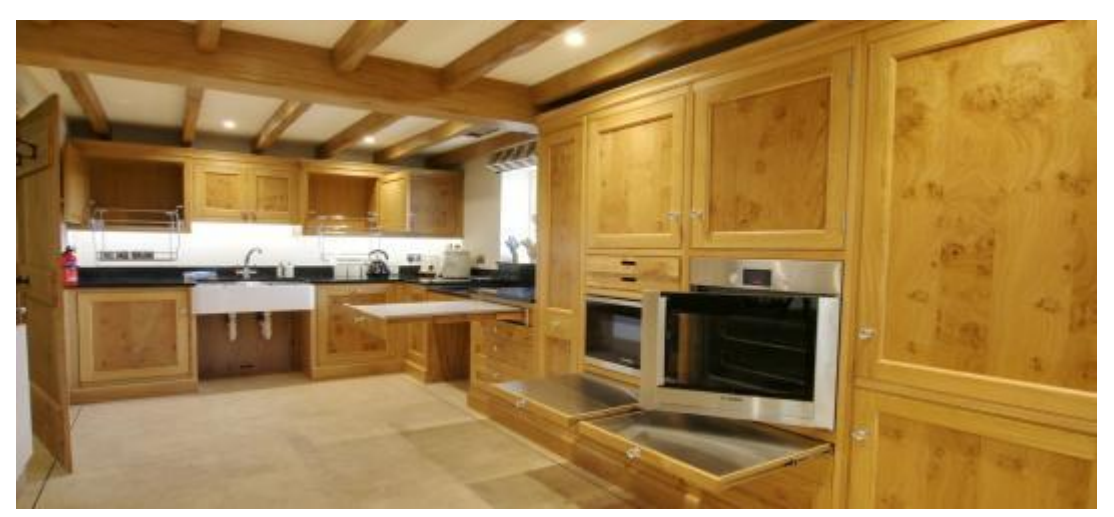
The Dairy, Newbiggin, - kitchen highlighting where accessible facilities are needed