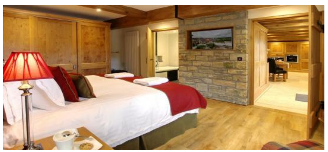
The Dairy bedroom is easily accessible to the hallway and the bathroom.