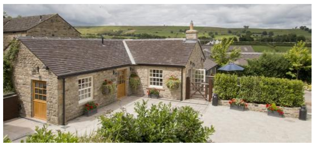
Level courtyard parking, drop-off and access to The Dairy, Newbiggin, Leyburn, North Yorkshire