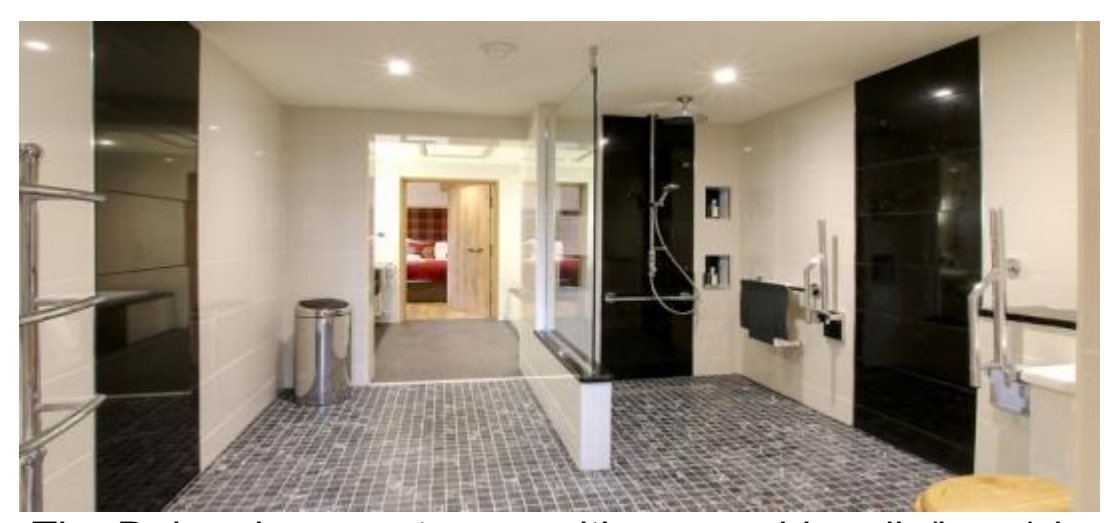
The Dairy - large wet room with removable rails/bars/shower seat