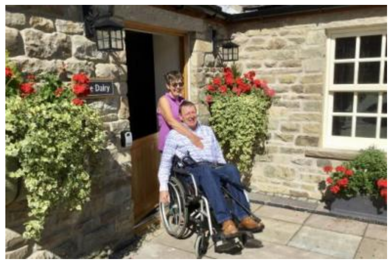
The Dairy - level access from the courtyard to the main door