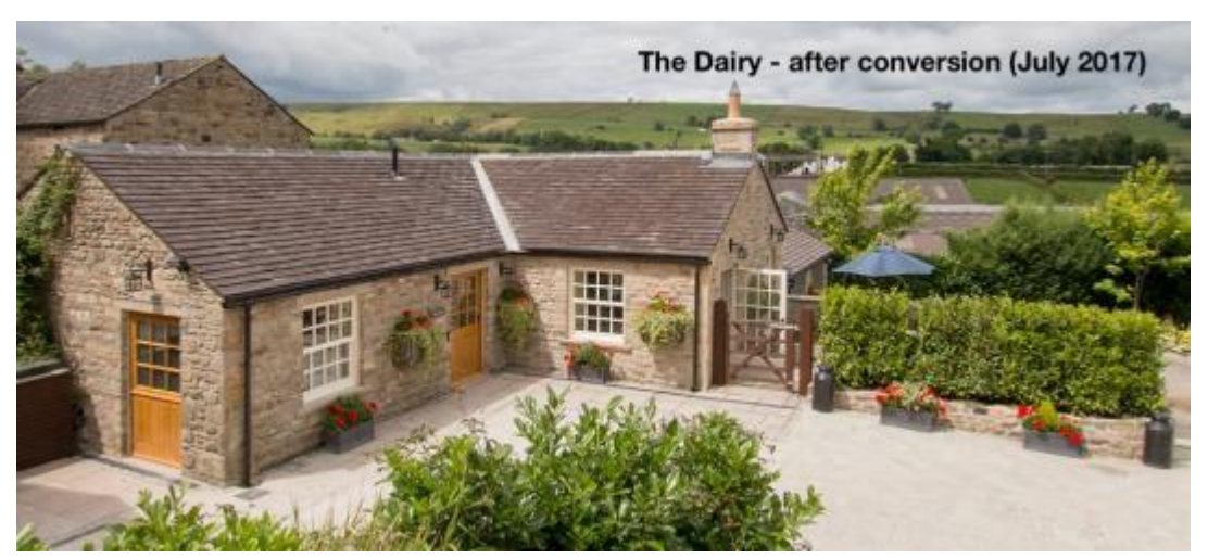
The Dairy - private patio with direct access from the main courtyard area through a gate