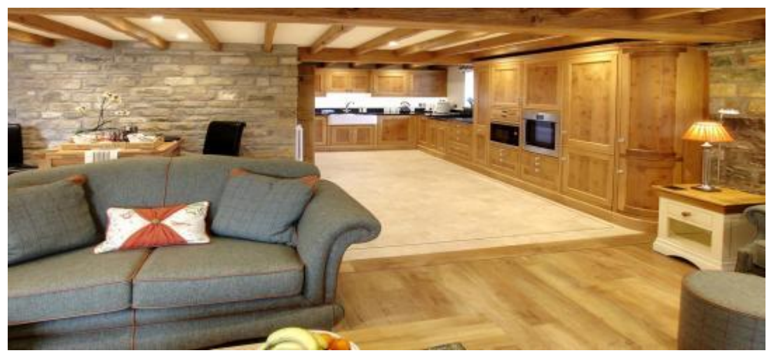
The Dairy - Spacious access from the lounge to the kitchen