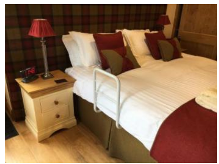
The Dairy bedroom - bed rail