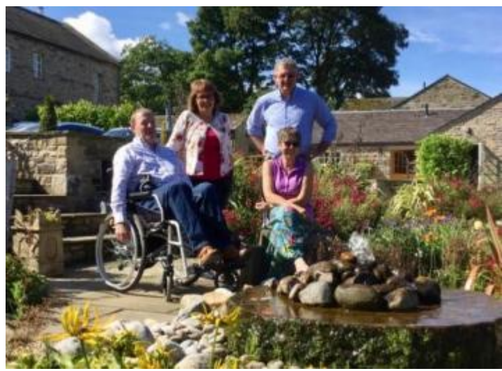
The Dairy - enjoying the larger garden in the grounds of Eastburn Farmhouse