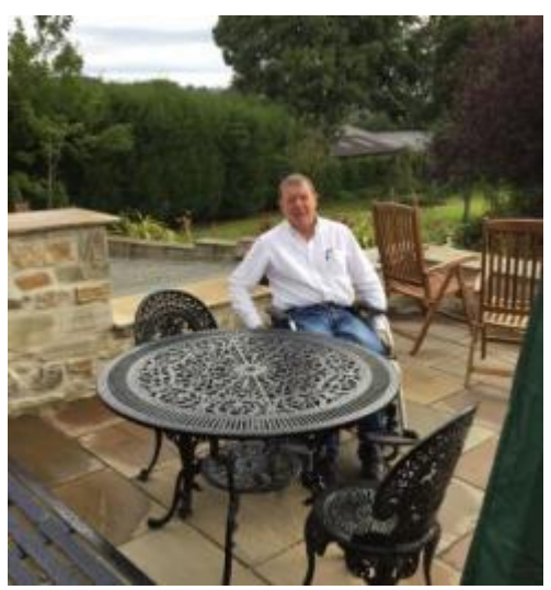
The Dairy - ample place to enjoy the view from the patio over the 3/4 acre garden