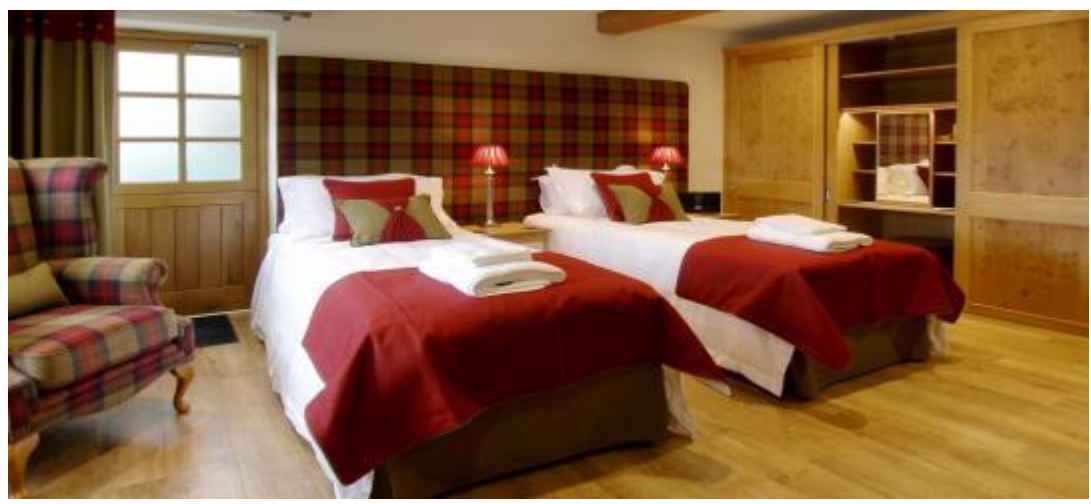
The Dairy bedroom as two single beds, each with double (not single) duvets.